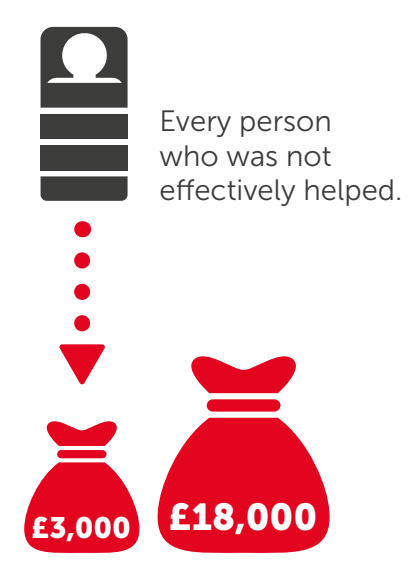
The taxpayer incurred additional costs of between £3,000 and £18,000 in the first year alone.

estimated that public spending would fall by £370 million if 40,000 people were prevented from experiencing one year of homelessness. This is based on interviews with 86 people who had been homeless for at least 90 days about the services they had used. These cost savings are reflected in research findings from both the US and Australia. These cost savings are reflected in research findings from both the US and Australia.